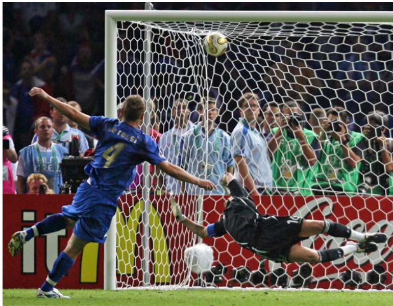
Italy's Daniele De Rossi scores a goal during the penalty shootout in the first 2006 final.

Italy's team is second on the list of most World Cup wins. In the 2006 final, Italy defeated France 5-3 in a penalty shootout. A penalty shootout happens if a game is tied after overtime. Five players from each team take turns kicking the ball from a spot twelve yards from the goal line. Only the goalkeeper , or "goalie," stands between them and the goal. The team that makes the most penalty goals is the winner.