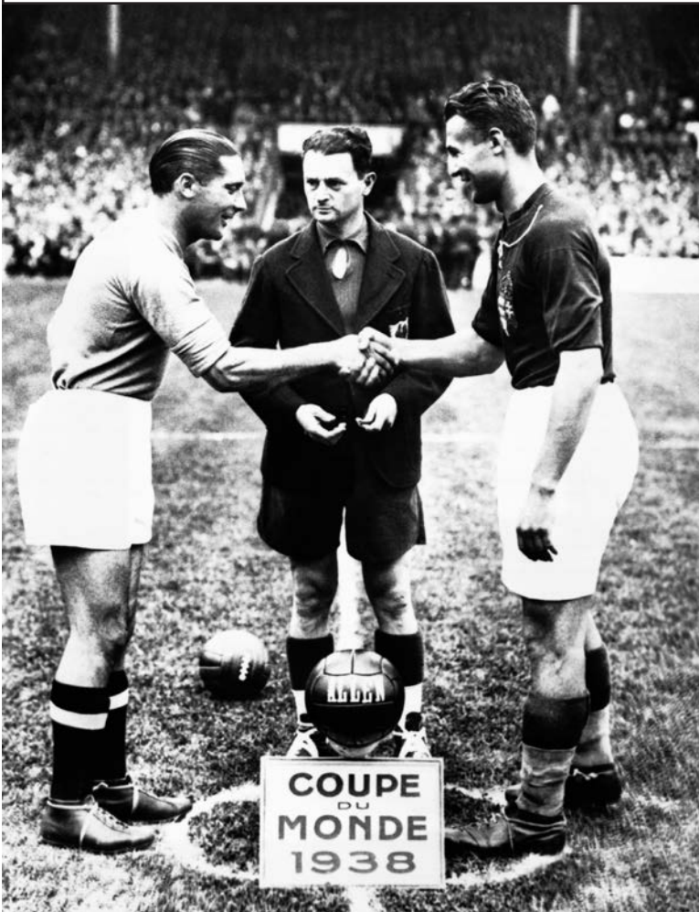
The captains of the Italian and Hungarian teams shake hands before the 1938 final match in Paris, France.

The first World Cup was held in 1930 in Uruguay. Only thirteen teams played in that tournament. It took teams from Europe almost three weeks to reach Uruguay by ship. There were seventeen games, with Uruguay defeating Argentina 4-2 in the final.