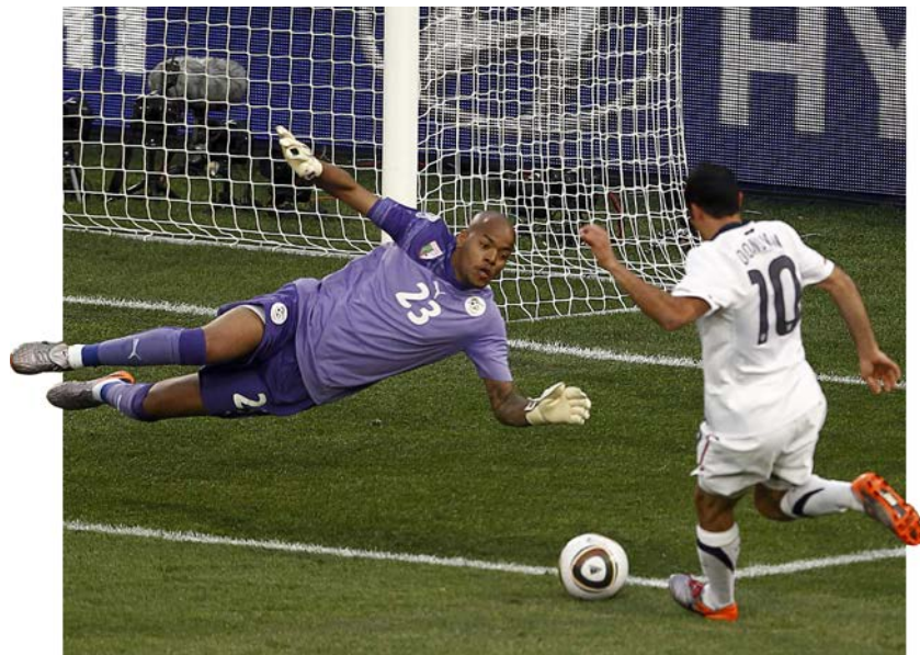
U.S. player Landon Donovan tries for a goal against Algeria during the 2010 World Cup.