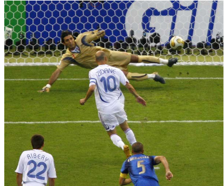
Zinedine Zidane scores a penalty kick against Italy in the 2006 World Cup final.