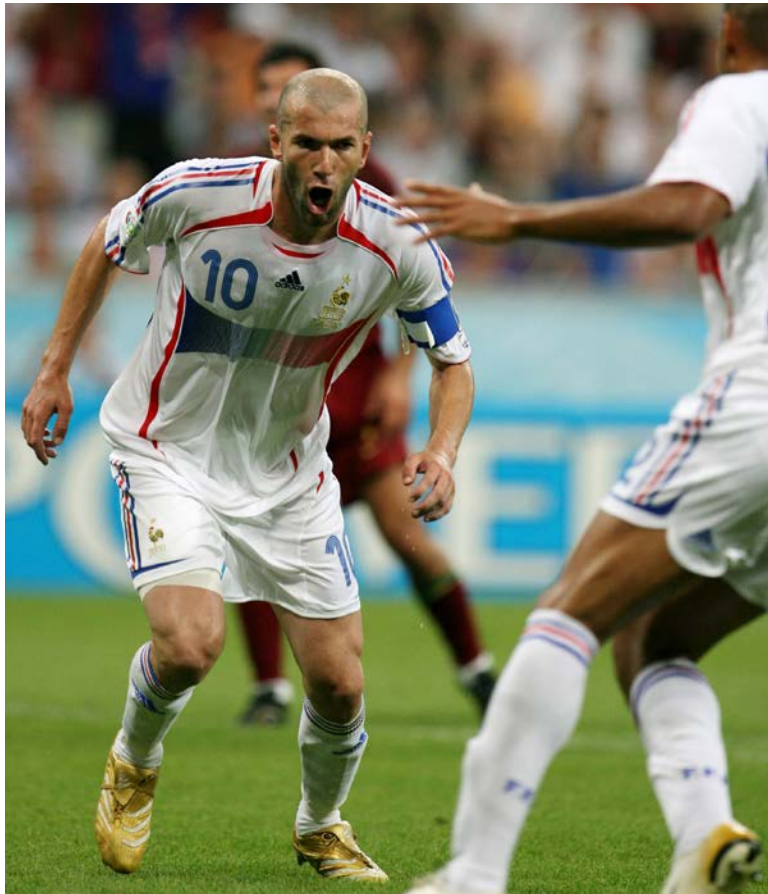
France’s Zinedine Zidane celebrates a goal against Portugal in a 2006 semi-final match.

Zinedine Zidane, also known as “Zizou” (ZEE-zoo), helped France win the 1998 title. He scored two goals to help France beat Brazil 3-0. He also scored for France in the 2006 final. Many people think of him as one of the sport’s greatest players.