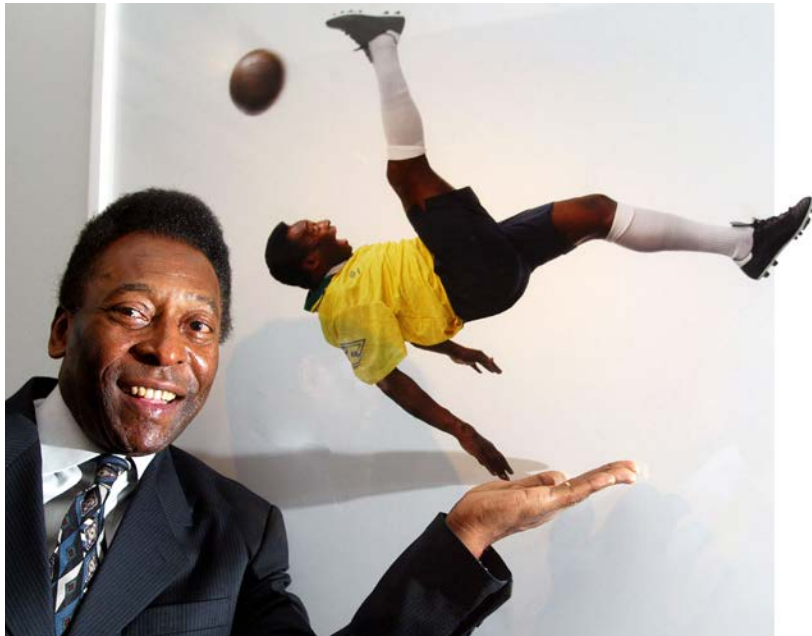
Brazil soccer legend Pele stands next to a photograph of himself doing his famous "bicycle kick."

Three of the biggest soccer legends are Pele (PAY-lay), Ronaldo, and Zinedine Zidane (zee-nuh-DEEN zih-DAHN). Most people consider Pele to be the greatest soccer player of all time. This Brazilian is the only man to have played on three winning World Cup teams. Pele scored twelve World Cup goals during his career.