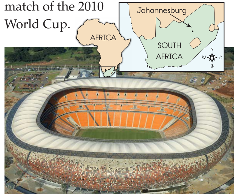
The Soccer City stadium in Johannesburg, South Africa

Although soccer is popular all over the world, a World Cup tournament was never held on the continent of Africa until 2010. That's why it was big news when South Africa was chosen to host the nineteenth World Cup. Over two hundred countries competed for the chance to send teams to the tournament. Johannesburg, the largest city in the country, was chosen to host the final match of the 2010 World Cup.