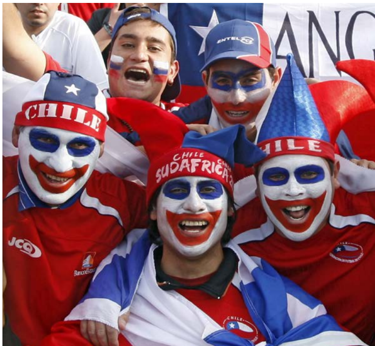
Chile fans support their team as it attempts to earn a spot in the 2010 World Cup.