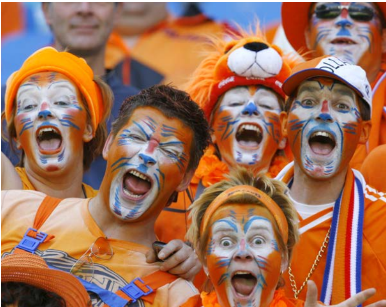
Fans of the Netherlands team show their support.

The World Cup is the most important event in soccer, maybe even in all sports. Every four years, the planet's best players come together to compete in the World Cup. It takes one month and sixty-four games to decide the winning team. Fans from all over the world come to watch their teams play. The fans wear crazy hats, paint their faces, bring drums to bang, and cheer on the players.