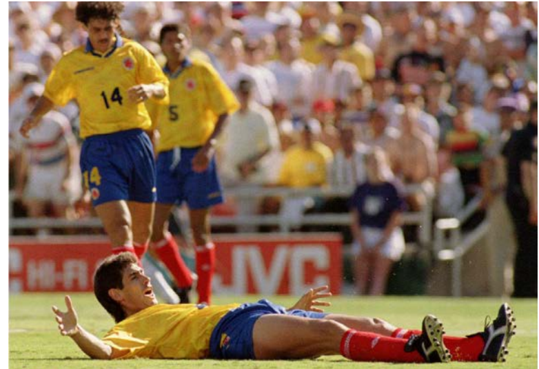
Colombian defender Andrés Escobar lies on the ground after kicking the ball past his own goalkeeper by mistake.