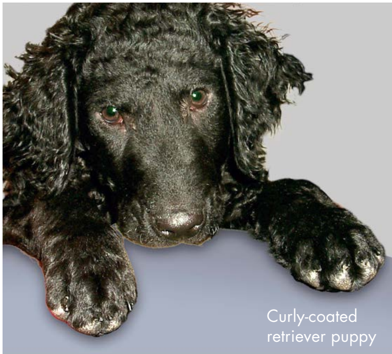
Curly-coated retriever puppy