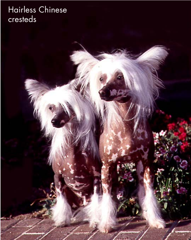
Hairless Chinese crested

The hairless Chinese crested is bald except for puffs of hair on the head and feet. It has dark gray skin with pink spots. It needs sunblock lotion in the summer. In the winter, it needs to wear a coat to stay warm.