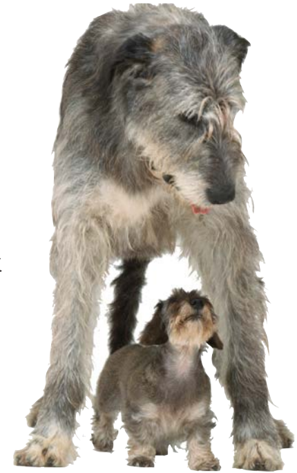
Irish wolfhound with terrier pal

The job of hounds is to chase game on the ground. There are two kinds of hounds. Sighthounds use their eyes to chase game. Scenthounds use their nose to follow the scent, or smell, of game. Hounds may bark to let a hunter know they have cornered the game, or they may kill the game themselves.