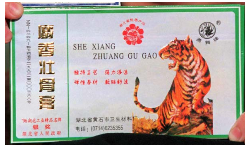
This Chinese medicine contains powdered tiger bone.

Why do people want tiger body parts? For many centuries, some Chinese medicines used tiger bones and other body parts. Some people thought that these medicines would help cure certain illnesses. They believed that a tiger's strength could heal people.