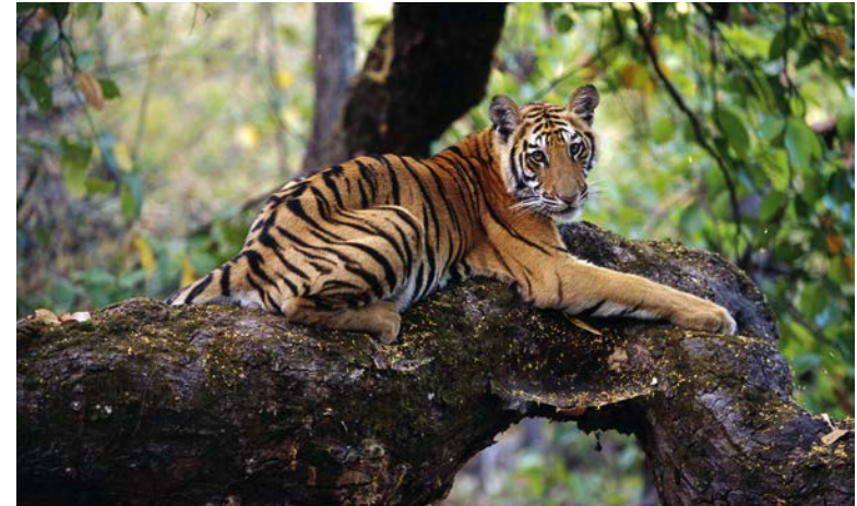
The tigers in India are Bengal tigers.