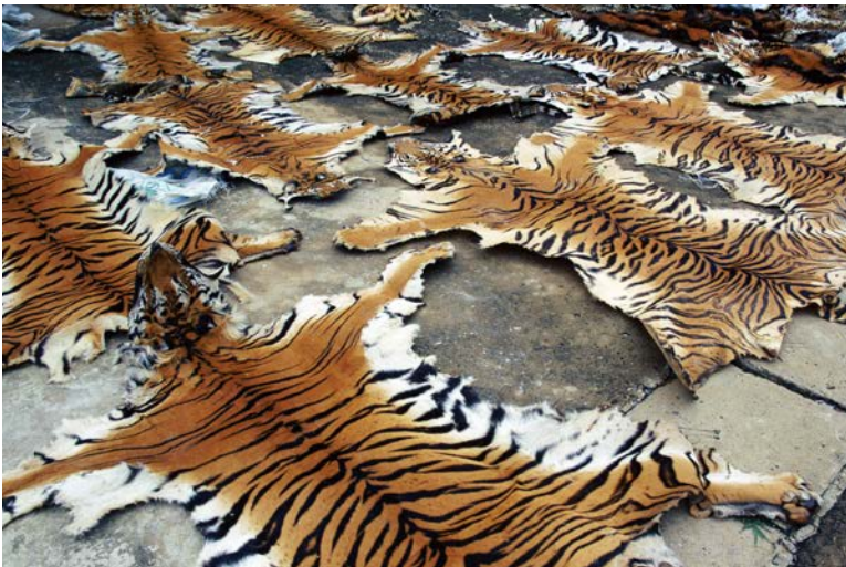
Poachers kill tigers to sell their skins as well as their bones and other body parts.

Governments protect tigers by passing laws to stop illegal tiger business. They also help by punishing poachers. In Russia, poachers used to pay a fine equal to only $50 for killing a tiger. Now they pay $20,000.