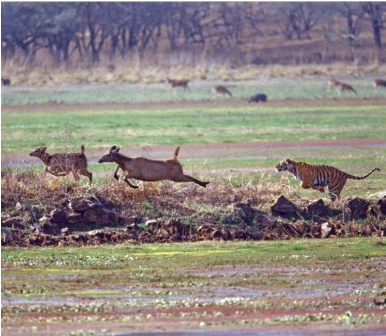
A Bengal tiger chases two sambar deer in India.

Tigers are among Earth's most beautiful animals. They are also important members of the habitats where they live. They help keep nature in balance. Tigers eat hoofed animals such as deer and wild pigs. Without tigers, these animals would eat too many plants. Then other animals that need the plants for food and shelter would suffer.