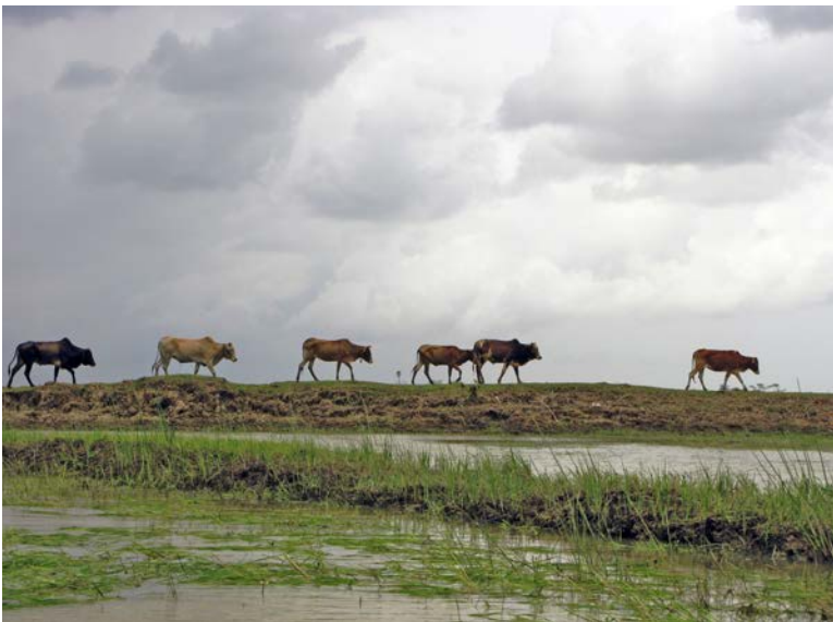
Cows walk in an area where tigers hunt. Some farmers poison tigers that eat their animals.

Tigers have less wild food, so they look for food closer to where people live. They sometimes attack people, but more often they attack farm animals such as cattle and sheep. Farmers shoot tigers that they see attacking their animals.