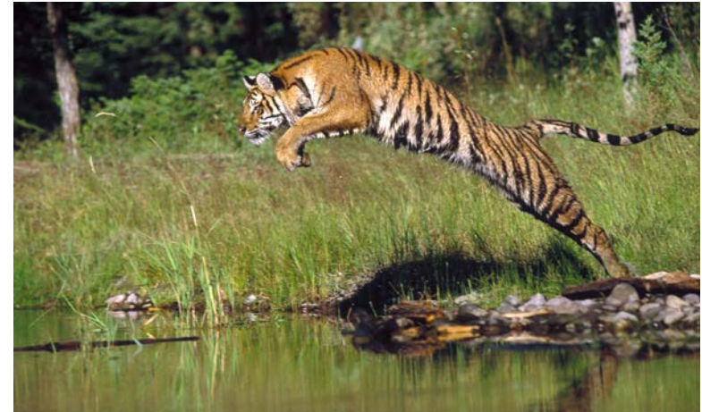
Tigers can only live in habitats that have hoofed animals, water, and dense plants.

Selling tiger products has been against the law in China since 1993. And most countries around the world have agreed not to buy or sell tiger parts or products. But poaching continues. Poachers care more about making money than about protecting endangered animals.