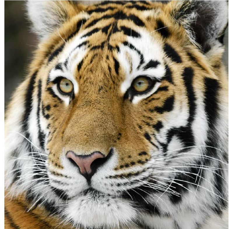
Tigers are the largest of all big cats.