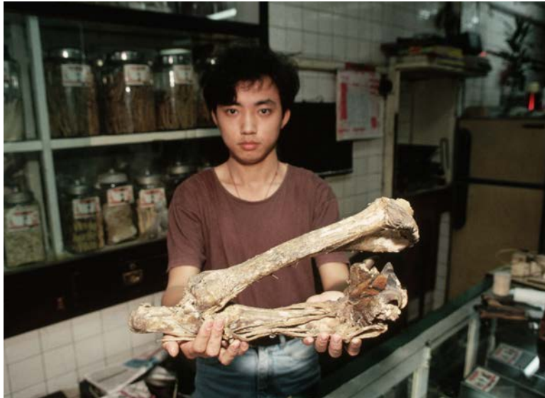
This shop in China uses tiger bones and sells tiger products.

Most Chinese medicines do not use tiger parts. But some companies still make medicines from tiger parts. Criminals can make a lot of money by selling dead tigers to these companies.