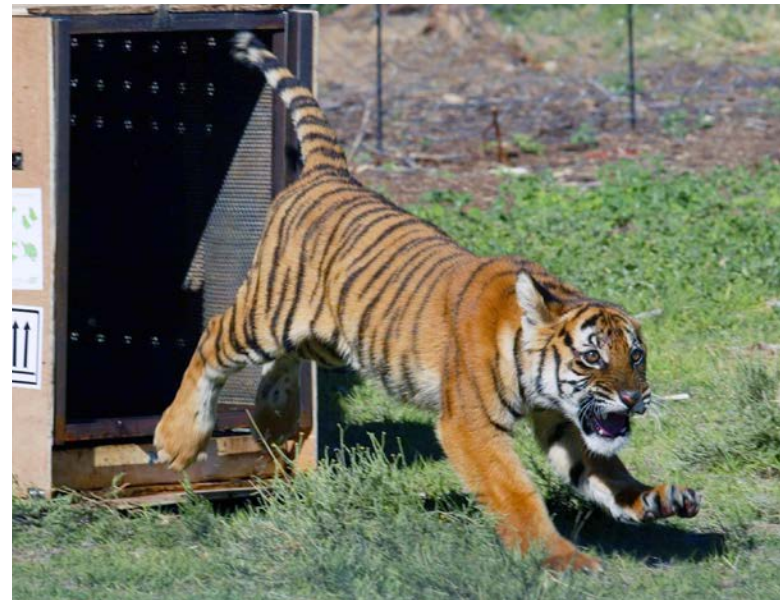
Some tiger cubs are able to return to the wild.

Conservation groups also teach people around the world about the need to protect tigers. And they help scientists and governments think about ways to work together to save tigers.